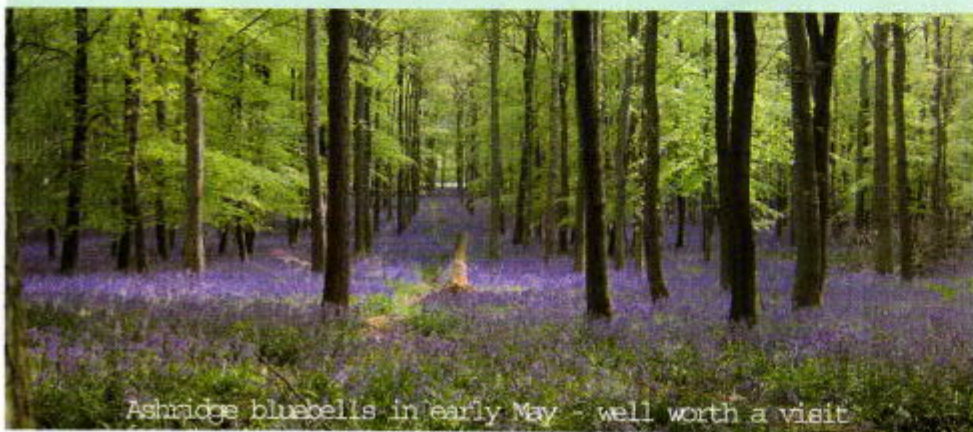
Ashridge bluebells in early May - well worth a visit