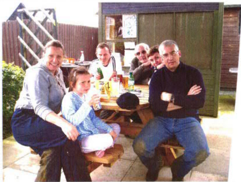
Top Start of the Rogation Day walk outside the Queen's Head.