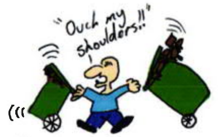
"There's got to be a better way ... "

Over 106 million pounds was collected last year from speed cameras alone, across the country,