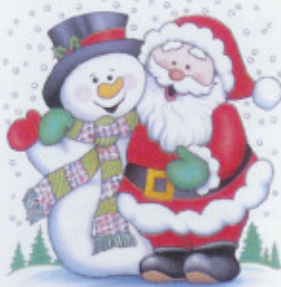
Christmas joy warms the heart