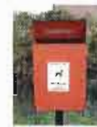
Then place in one of these!

The council receive many complaints regarding dog mess not being picked up. The following is taken from the Central Beds Council website :