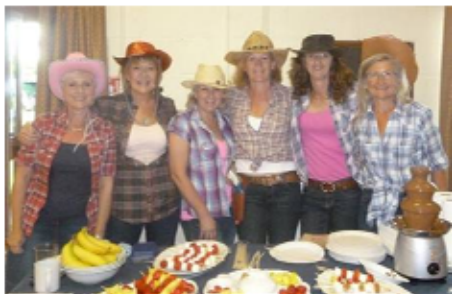
Chocolate Fountain Stall Chalgrave Games July 2011

Highlights included a film evening, Pamper Demonstration, Dog obedience demonstration, Image Consultant, Swishing Event, Dream interpretation, Ghostbusting evening and belly dancing demonstration