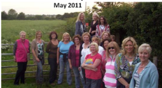
Country Walk June 2011

Also don't forget we are on facebook and that holds details all our events too. https://www.facebook.com/pages/Chalgrave-WI/173154812708705