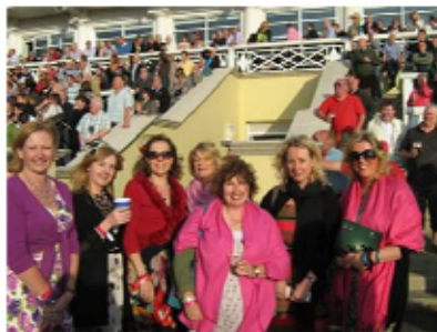
Ladies day at Towcester races May 2011