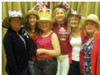
Royal Wedding Party April 2011