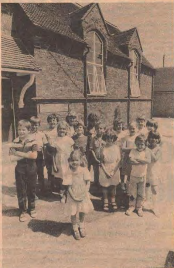
● The last class at Chalgrave School. They leave for good at the end of this term.

But that is not to be and Chalgrave joins the 11 other schools condemned in last year's survey of the county's small rural schools. The